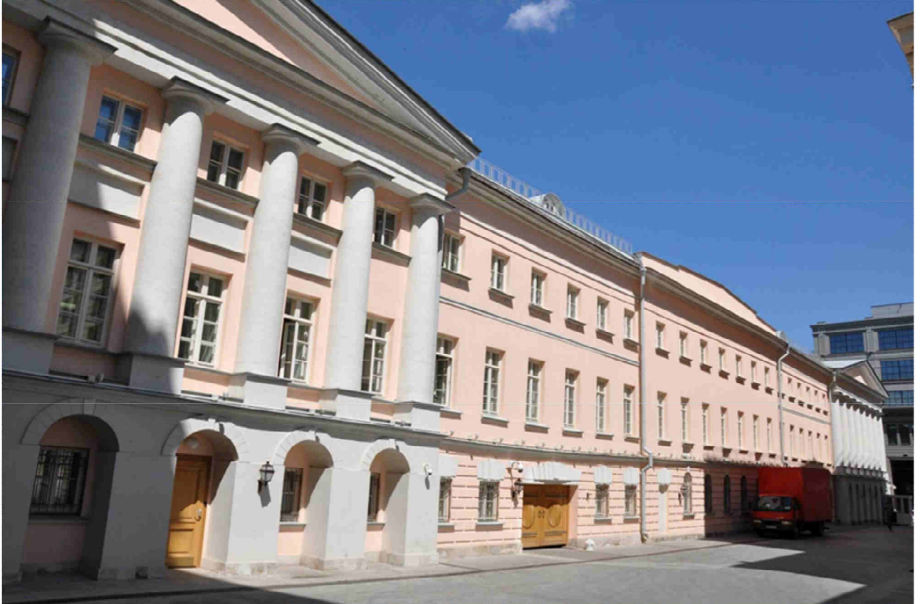
Fig. 2 - Khomyakov House. The facade along Kopyevsky Lane, architect Giuseppe Bova, 1823.

moldings - masks, garlands, friezes - clearly stand out on the surface of the warm, ochre-yellow walls, and these two primary colours enrich each other.