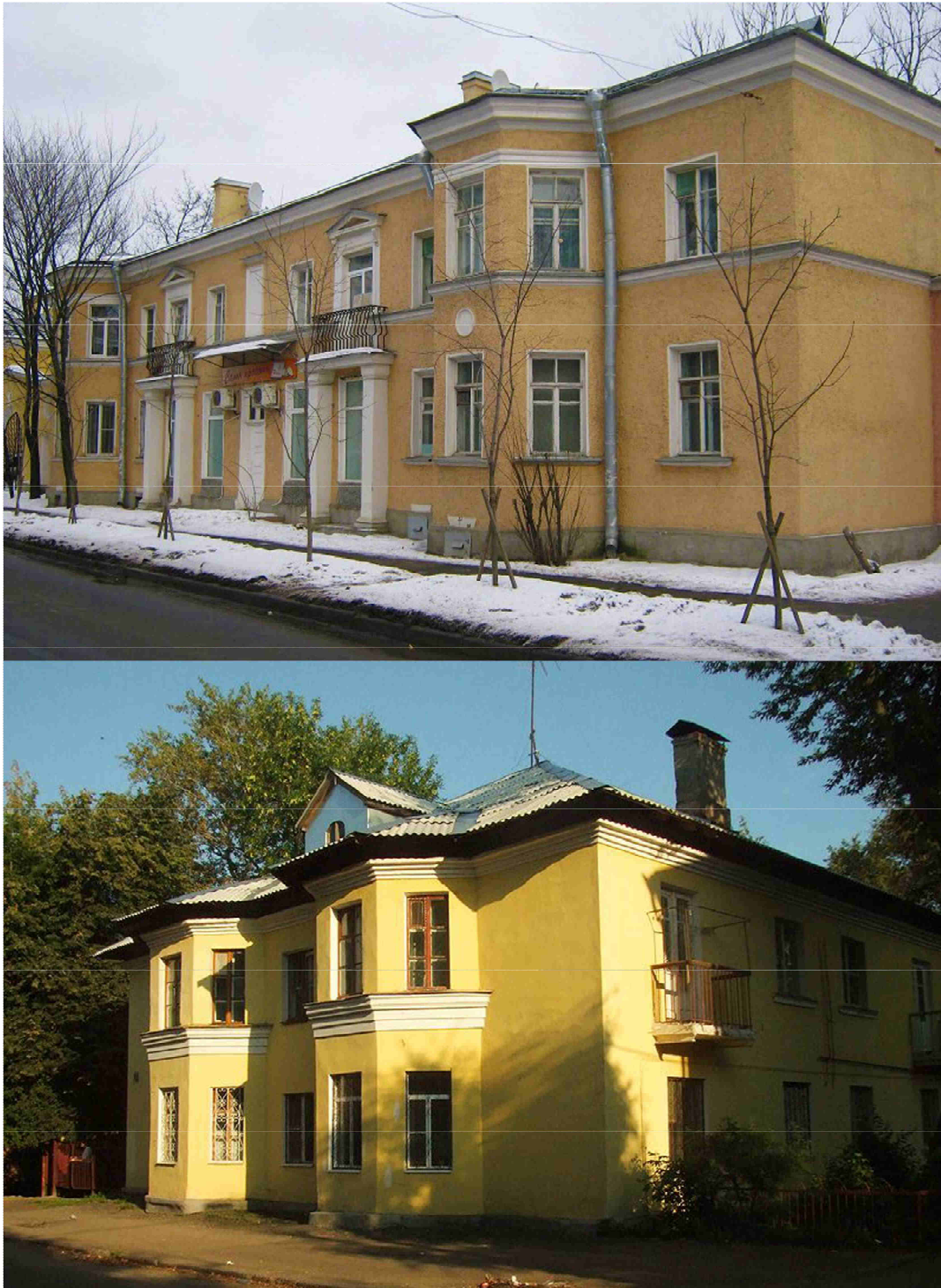
Fig. 3 – Residential buildings of Soviet neoclassicism , 1940s.

At the time the promotion of traditional values and the ideology of good citizenship received widespread, and that was the main criterion for strengthening the position of Stalin's neoclassicism.