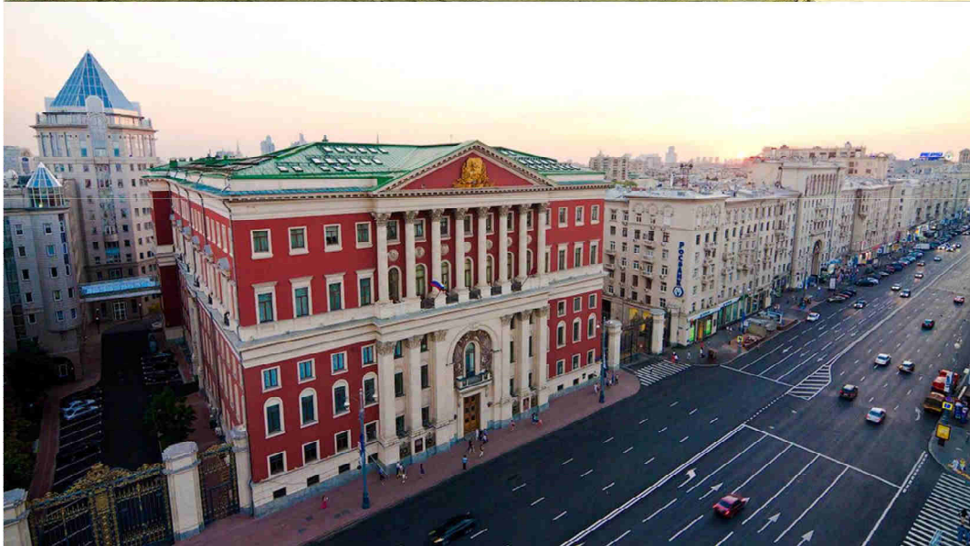
Fig. 4 - Chernyshev House, project by M.Kazakov. Now it is the building of the Moscow mayor's office.

With the help of colour it is possible to emphasize individual buildings among other structures of the architectural complex. A striking example of this is the building of the Moscow mayor's office, which is located on Tverskaya Street, 13. In 1782 the residential house was built by count Z. Chernyshev in the style of Russian classicism on the project of architect Matvey Kazakov. (Fig. 4) In 1790 the Treasury bought the building. The original facades were made in yellow and white. Since 1917 the building was under the jurisdiction of Moscow Soviet, it acquired intense colour (rich dark red), which became to emphasize it among the other buildings formed the