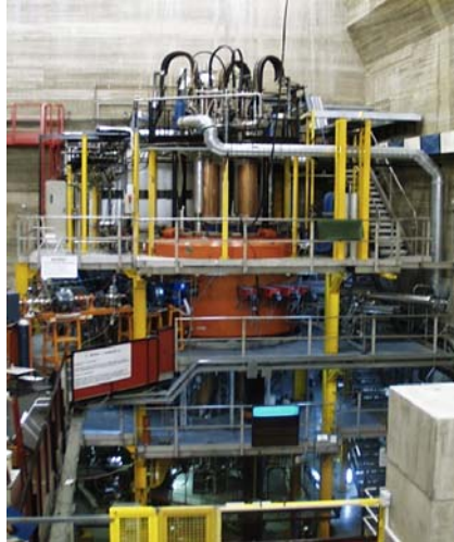
Fig.2: A view of K800 Superconducting Cyclotron at Laboratori Nazionali del Sud in Catania.

The present limit of low beam current we have experienced both for the CS accelerator and for the MAGNEX focal plane detector must be sensibly overcome. For a systematic study of the many “hot” cases of \beta\beta decays an upgraded set-up, able to work with two orders of magnitude more current than the present, is thus necessary. This goal can be achieved by a substantial change in the technologies used in the beam extraction and in the detection of the ejectiles. For the accelerator the use of a stripper induced extraction is an adequate choice. However, with the present set-up it is difficult to suitably extend this research to the “hot” cases, where \beta\beta decay studies are and will be concentrated. For the spectrometer the main foreseen upgrades are: