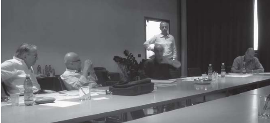
Figure 3.17: The setting of the Turin workshop

During the first hour of the workshop, the WU explained the research, the planning question, the concept of accessibility used to tackle the problem, and the instrument to be used for assessing accessibility. This introduction provided for the sharing of possibilities and limitations given by the InViTo tool in calculating accessibility. The presentation of the tool prompted a discussion on the concept and measures of accessibility (defined in different ways). Most of the participants defined accessibility in terms of time, so that the distance-based setting of the new version of InViTo was seen as incomplete. This step was very useful for thinking about new methods for calculating accessibility, and the participants showed their interest in contributing to the definition of new formulas to be used in InViTo. Since InViTo does not intend to provide numerical responses and is flexible to be adjusted in different ways, the participants accepted the distance-based setting and used the tool.