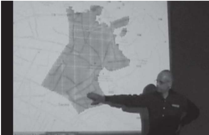
Figure 3.18: Participant with InViTo map