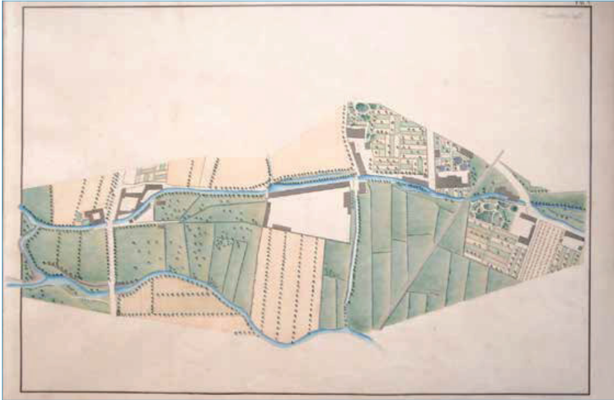
The Rio Moirano from the Mulino Nuovo to the Fabbrica Elettrodi.