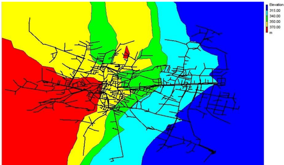
Fig. 1. Scheme of the WDN analyzed in the present work. The colormap represents terrain elevation.

The scheme of the considered WDN is shown in Figure 1. The WDN serves a hilly area extending over approximately 30 km 2 with elevations ranging between 300 and 490 m a.m.s.l. The WDN is divided in a lower, an intermediate, and an upper district whose daily average demands are 82, 120, and 6 l/s, respectively. Most of the demand is given by residential users, with the additional contribution of an industrial zone in the eastern part of the lower district.