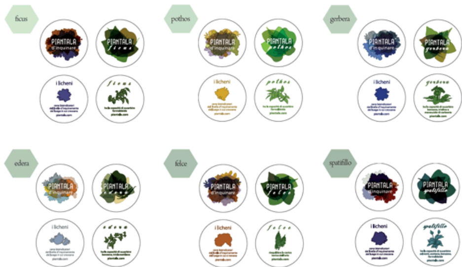
Figure 5 Lichens overview

The Crocetta district is one of the most elegant in the city. However, being in the most central part of the city suffers from a lack of public green areas and chronic air pollution because it is crossed by major street arteries of urban mobility. The project, therefore, aim to introduce in the neighborhood more "green" and to communicate and empower the residents on the problems of air pollution situation. Through the use of particular plant species (lichens) "Piantala" intends to monitor air quality with natural indicators installed in selected areas of the urban space (fig.5). The recognition of garden shops, associations, the "Earth and the man" museum, the GAM the modern art gallery and a FabLab has made possible to set up a collaboration to act in two different ways. First of all, to build and distribute a "green kit" of plant, able to mitigate the pollution of outdoor and indoor air. Secondly to make aware people about the real situation and to propose actions of active citizen, as a "green founding" where it is possible contribute and choose where and which plants to plant in the area.