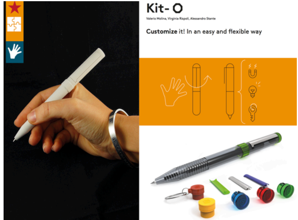
Figure 7 Kit-O pen

The project is planned according to the design by elements rules. The analysis of this project was focused on materials and components in order to extend the life and the pragmatic use of the pens, with a sustainable perspective. The solution is based on a unique base where it is possible to connect freely functional and aesthetic fitting. With an easy and flexible assemble and disassemble, able to create many different product models. Besides Kit-O allows to produce different pen models from a single production line. A grip, metallic or magnetic ring, a key-ring, a led for lightning are only some of the adding. The project carries on also a study on the possibility of the user to shape up a customized pen through the 3D pen software from the company website.