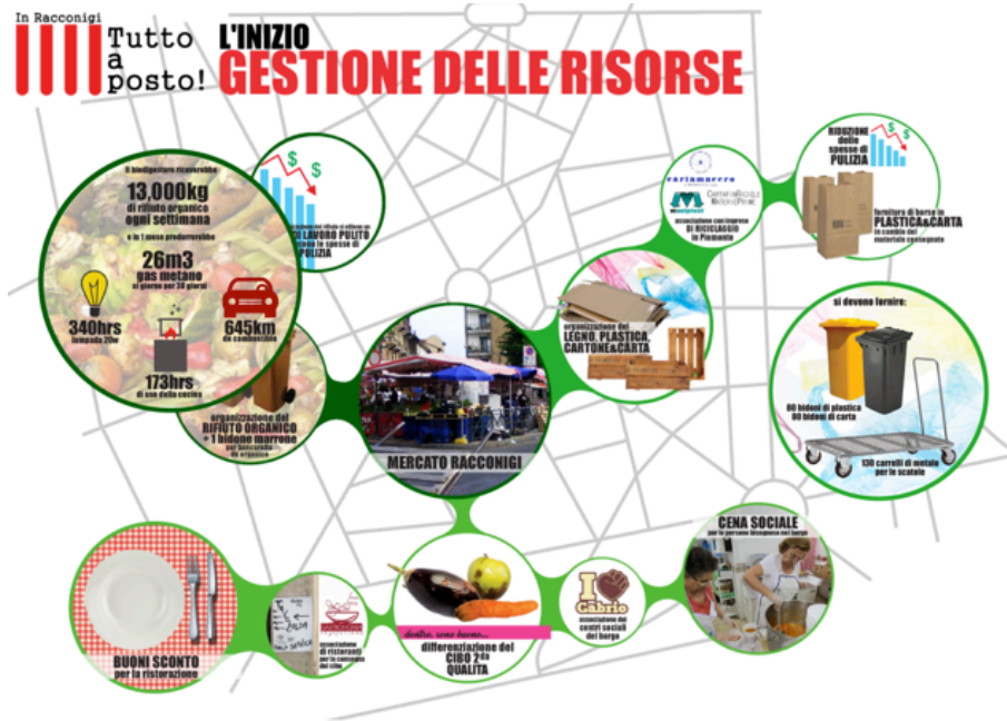
Figure 4 All right overview

The whole project aims to place a market through innovative management and a re-organization in terms of space and facilities to exploit and re-evaluate the deviation of one of the longest markets in the city (almost 2 km). Through the education and communication, it attempts to enhance the value of waste (fruit and vegetables still good but not aesthetically marketable) in support of the socially disadvantaged. The project also introduces new methods of waste disposal inedible, such as cardboard and wood, for proper disposal in favour of discounts on cleaning and rent for the hawker area and an automatic management of allocations of the market areas free (fig.4).