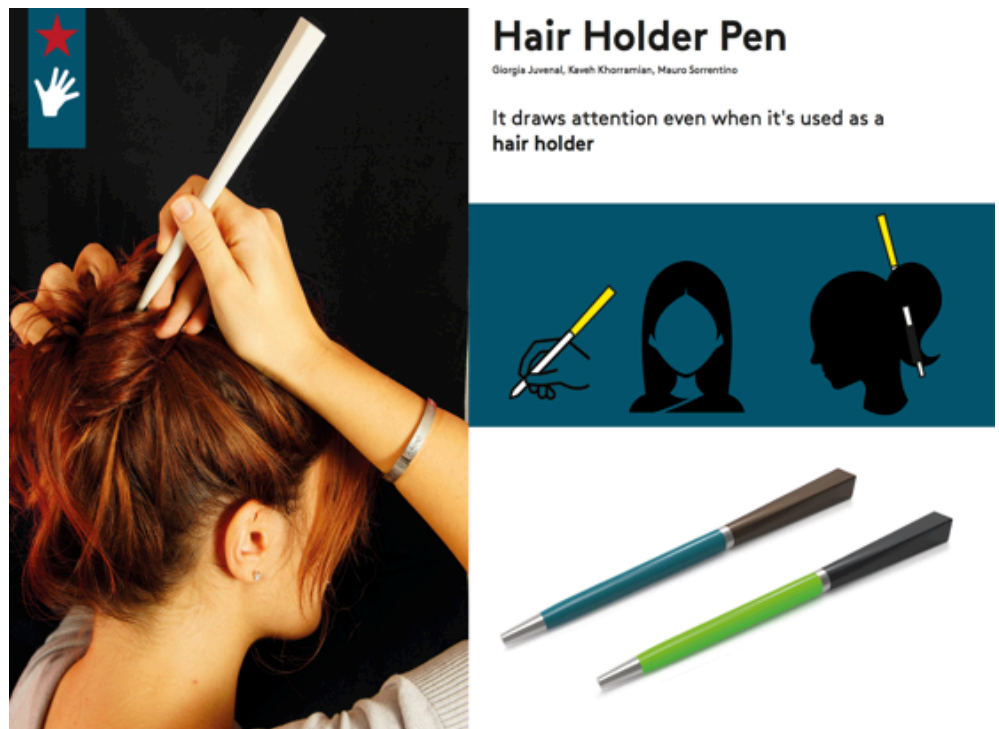
Figure 6 Hair Holder pen

This idea was developed after a careful analysis of the ergonomic use / interaction of the pen for a particular target: the women. Starting from an improper pen's use such as to hold the hair, the aim of the concept was to extend the life of the promotional object giving it a second function. The result is a pen that draws attention even when used as a hair holder (fig.6). The pen body was reviewed to be slender and linear shaped for an ease hair introduction. The project studied an ergonomic pen to look and to be physically predisposed to write and hair holder at the same time. The result is a pen with a shape transition from a square section, in the upper part, to a circular section towards its grip. The length unusual designed specifically to be used as the holder's hair.