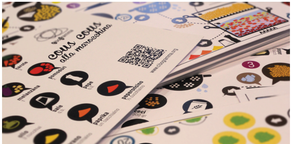
Figure 3 -cibogramma postcard

PARIS DESCARTES UNIVERSITY PARIS SORBONNE UNIVERSITY PARIS COLLEGE OF ART ISTEC PARIS