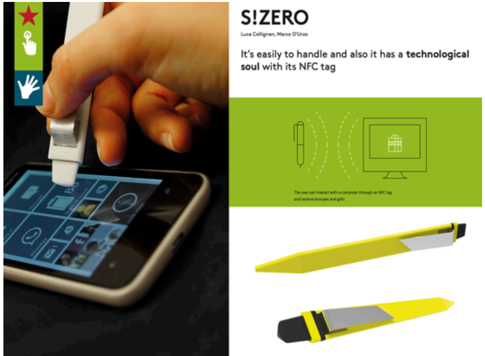
Figure 8 S!Zero pen

PARIS DESCARTES UNIVERSITY PARIS SORBONNE UNIVERSITY PARIS COLLEGE OF ART ISTEC PARIS