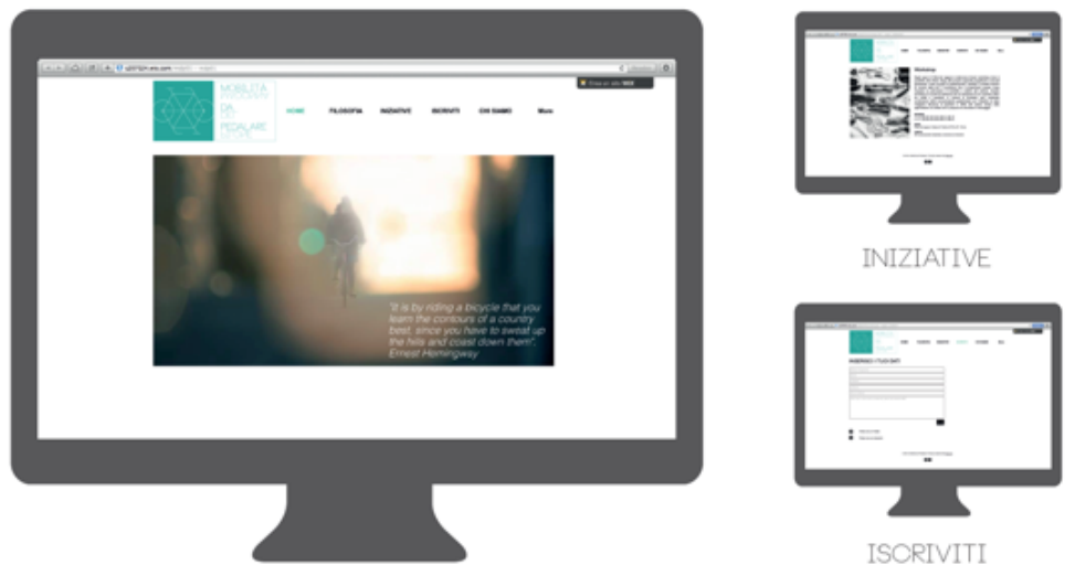
Figure 2 –mdpi website

This project has designed a range of aggregate services to characterize the urban space as a "neighborhood of the bicycle". In this case the analysis of the territorial context underline a high propensity to a cycling culture. That was demonstrated by a range of infrastructures like the Motovelodromo and the last km of the bicycle path Vento (2013), just near to the sculpture dedicated to the most famous Italian cyclist: Fausto Coppi. Starting from the analysis, the project developed an integrated service managed by a consortium (fig.2) able to connect all the satellite territory structure (shop, bar, associations, etc.). The concept valorises the assets of the district through attracting the cyclist enthusiastic with a series of discounts, workshops, events with an environment and a communication completely tailored for them.