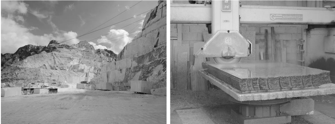
Figure 1: At the left, marble quarry in the Colonnata basin (Carrara); at the right, cutting of granite slabs (Crodo, Verbania)

In such systems, indeed, the whole is much more than the sum of its parts, because it has to be added also the contribution of the trans/cross-boundary interrelationships between and among the parts (Halog and Manik, 2011).