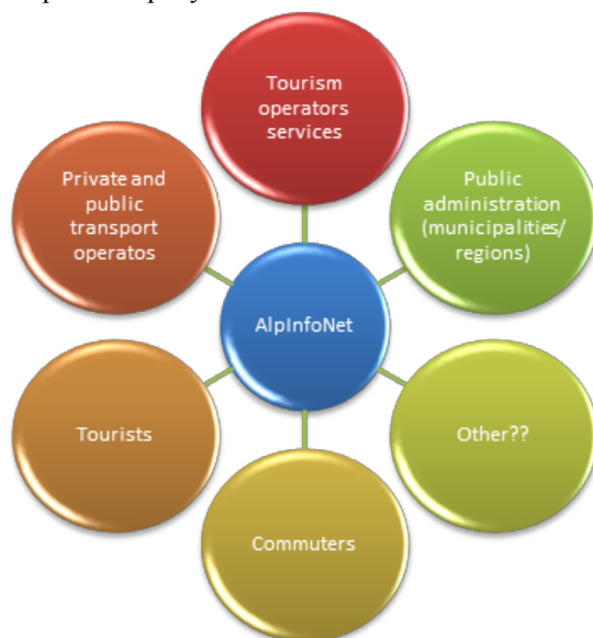
Fig. 2. AlpInfoNet potential users

A main constraint for the public transport operators regards the need to create data compatible with the application because the standardisation of data is expensive. Thus, to be sure that the public transport operators are willing to use the AlpInfoNet tools/services, such services have to ask for very few standard data or little manipulation of data from the transport company.