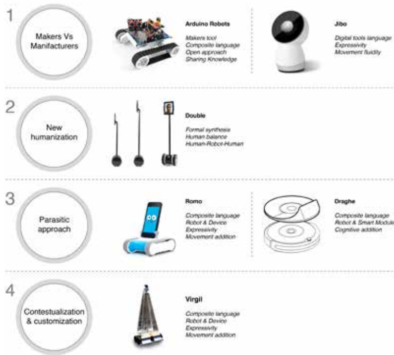
Fig. 2. Emerging trends and related factors, in contamination between Robotics and Digital world.

From these relationships emerge some main areas that characterize the contamination between the digital world and service robotics.