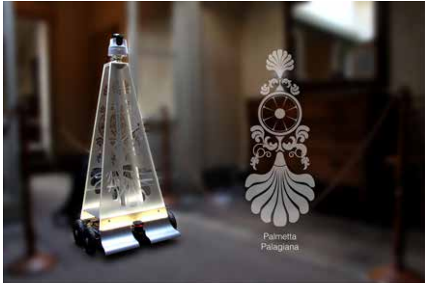
Fig. 3. Robot Virgil with a particular of Palagian palm, 2014.