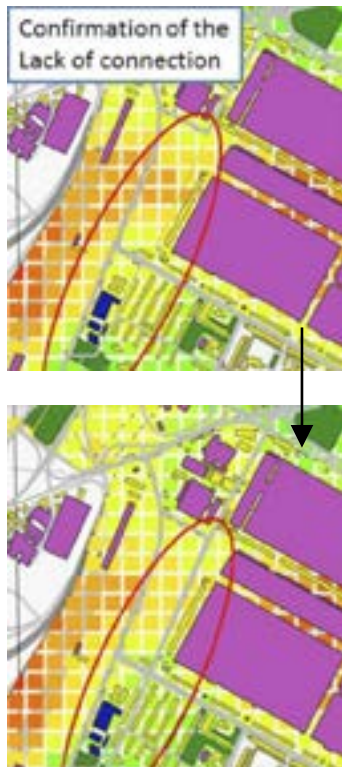
Figure 2. The use of InViTo during the second SINERGI workshop, Turin, June 2015: identification of an existing infrastructural lack (left) and checking of a design idea for a new road (right).

fields such as urban planning, transport planning, mobility, environment, social and economic sciences. The InViTo structure was conceived as open as possible in order to avoid constraints in the use of the tool. Thus, it can be used for dealing with different case studies, with different purposes and afferent to various disciplines. The following three case studies show some example of applications of InViTo.