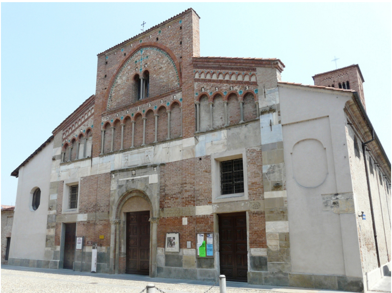
Fig. 2 Facade of St. Peter's Church, Cherasco. ( http://archeocarta.org ).