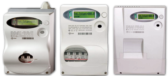
Figure 4. Smart meters used for Telegestore – from left to right: single phase (GISM), poly phase meter for demand up to 30 kW (GIST), poly phase meter with current transformer (CT) for demand up to 200 kW (GISS).

core and metrology functions. STCOMET simplifies the design