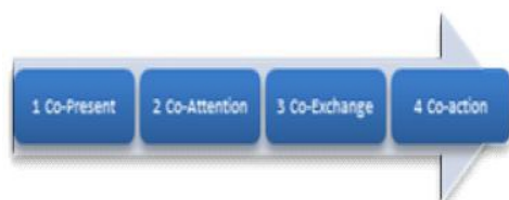
Fig. 2 Four levels of Social Interactions

space and place theory, ‘Situation’ is similar to ‘space’, which refers to physical qualities of a physical environment [5]. Goffman argued that any kind of focused interaction is ‘encounter’, which is constituted a major part of our daily life [2], [6]. However, [3] presented two stages (Active/ Passive Social Interactions) and four levels of Social interaction including Co-Present, Co-Attention (Passive Stage) and Co-Exchange, Co-Attention (Active Stage). Fig. 2 shows four levels of Social Interactions.