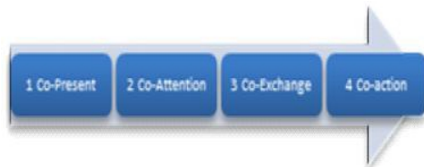
Fig. 2 Four levels of Social Interactions

space and place theory, ‘Situation’ is similar to ‘space’, which refers to physical qualities of a physical environment [5]. Goffman argued that any kind of focused interaction is ‘encounter’, which is constituted a major part of our daily life [2], [6]. However, [3] presented two stages (Active/ Passive Social Interactions) and four levels of Social interaction including Co-Present, Co-Attention (Passive Stage) and Co-Exchange, Co-Attention (Active Stage). Fig. 2 shows four levels of Social Interactions.