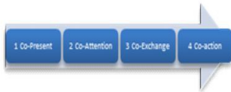
Fig. 2 Four levels of Social Interactions

space and place theory, ‘Situation’ is similar to ‘space’, which refers to physical qualities of a physical environment [5]. Goffman argued that any kind of focused interaction is ‘encounter’, which is constituted a major part of our daily life [2], [6]. However, [3] presented two stages (Active/ Passive Social Interactions) and four levels of Social interaction including Co-Present, Co-Attention (Passive Stage) and Co-Exchange, Co-Attention (Active Stage). Fig. 2 shows four levels of Social Interactions.