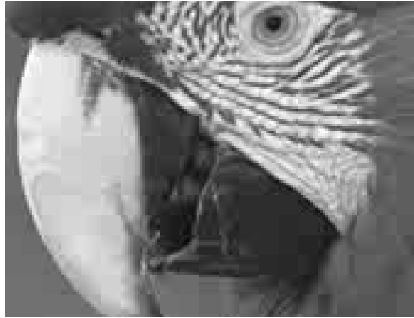
(a) DCT 8 \times 8