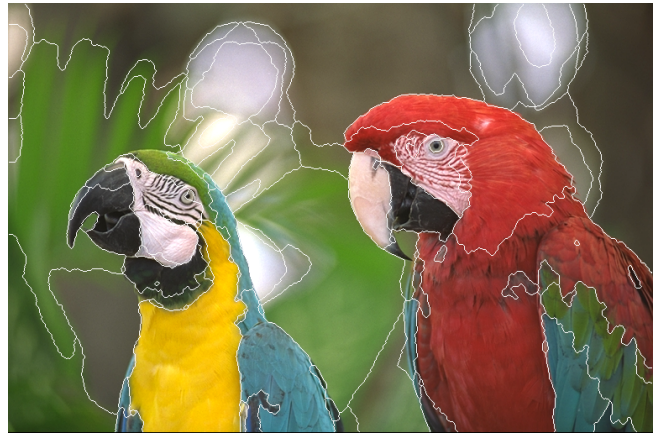
Fig. 1. An image divided into 100 regions by the proposed algorithm.

To solve this problem, in the past years different solutions have been proposed. Some variations of the DCT have been developed, such as directional DCT [2], adaptive block-size transform [3] or shape-adaptive DCT [4], in which the block size and shape are defined taking into account the edge location or the transform is evaluated avoiding to cross edge discontinuities. Wavelet approaches have also been introduced. To avoid filtering across edges, researchers have studied different wavelet filter-banks based on the image geometry, e.g. bandelets [5], directionlets [6] and curvelets [7]. However, all the proposed methods produce an efficient signal representation only when edges are straight lines, making them inefficient in presence of shaped contours. Recently, a novel graph-based transform approach has been proposed. Any image can be viewed as a graph, where each pixel is a node of the graph and weighted edges