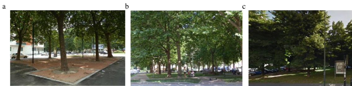
Fig. 1. (a) Area with Biostrasse paving (Bottesini square); (b) Mix area with grass and concrete paving; (c) Green area with grass.

Paving materials used for the experiments were selected from next generation environmental high performance pavements products already on the market. In particular, two water-bound path surface has been chosen: Biostrasse and i.idro Drain. Biostrasse and i.idro Drain are two different polymer modified concrete surfaces, consisting of sand, gravel clean, water, pigments, cement and a binder, without oils and bitumen substances. In this work, thermal comfort in three urban areas were compared, with similar characteristics of morphological shape of the buildings' surround, but different characteristics of pavement (Fig. 1): the project area with new paving materials and two public spaces with grass and a mix of grass and concrete paving.