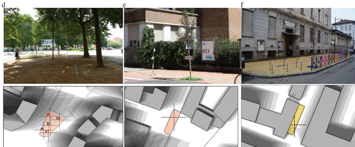
Fig. 2. (d) Area with Biostrasse paving: Bottesini square; (e) Area with Biostrasse paving: Mercadante street; (f) Area with i.idro Drain paving: Santhià street; the represented points have similar sunshine index and indicate the grid of measurements.

As shown in Fig. 1, the selected areas are characterized by the presence of trees and similar urban context. The determination of a grid of points with similar obstructions and sunshine indexes (Fig. 2d) was conducted with Ecotect 2011®. The selected points have been used for the measurements campaign. Moreover to analyse the thermal behavior of paving materials under direct solar radiation conditions, two other zone were selected. In Fig. 2e the area with Biostrasse paving and in Fig. 2f the area with i.idro Drain paving are reported.