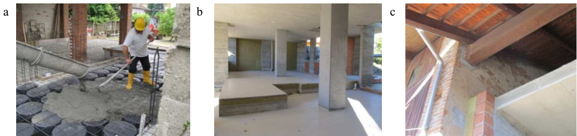
Fig. 2. (a) casting of the floor slab above disposable formworks; (b) structure of the house with insulation layers; (c) roof details.

Windows are composed by aluminum frame with thermal break with low-e triple-pane glass with argon ( U_{\text{window}} = 0.96 \text{ W/m}^2\text{K} ). Thermal bridges are eliminated through a careful study of anchoring and joints between external insulation layer and window wooden sub-frames.