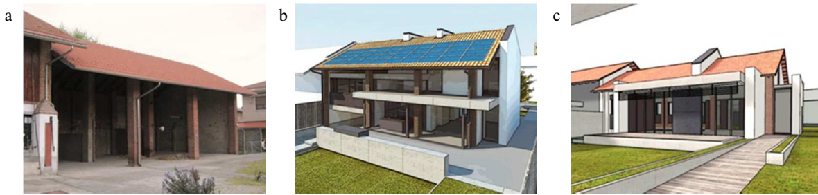
Fig. 1. (a) The preexisting rural building, south front; (b) the first design concept; the current architectural design.