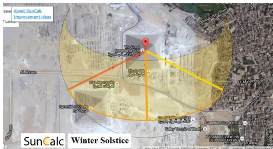
Figure 1: Using SunCalc we can find that Khufu can see the point of the horizon where the sun is setting on the winter solstice, and then he can see the same on all the days of the year. This happens because Khafre's architects have considered a proper place for the new pyramid. No problems for sunrise, because horizon is free.

The second pyramid that had been built was that of Khafre. In fact, Khafre had probably the same desire to admire sunrise and sunset from its pyramid. But its horizon was not free because constrained by his father's pyramid. It is probable that Khafre's architects decided the position of the new pyramid, in order that the king could see the points of the horizon where the sun was rising and setting thorough the year, maintaining the same possibility for Khufu. And in fact, if we use SunCalc (see Figure 1), we can see that Khufu sees the point of the horizon where the sun is setting on the Winter Solstice and therefore he can see the same on each days of the year. This happens because Khafre's architects have considered a proper place for the new pyramid. No problems for sunrise, because horizon is free. Of course, the Khafre's architects have considered that their king would like to observe the sunrise on each day of the year. Using SunCalc (see Figure 2) we can find that Khafre can see the point of the horizon where the sun is rising on the summer solstice, and then he can see the same on each day of the year. No problems for sunset, because horizon was free.