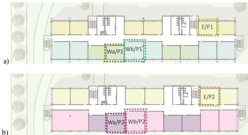
Fig. 2. J.C.Maxwell building: 1 st floor (a); 2 nd floor (b).