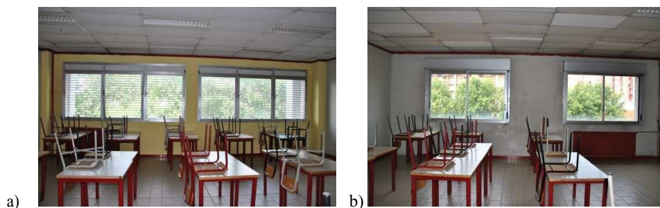
Fig. 3. Daylighting systems for classrooms at 1 st floor (a) and 2 nd floor (b)

At first floor classrooms belonging to the type of E/P1 and Wa/P1 ( A_{\text{floor}}=50.4 \text{ m}^2 ) fulfill the credit required by the LEED 2009 for Schools: the product of \tau_{\text{vis}} and WFR is 0.16. On the other hand classrooms belonging to the type of Wb/P1 ( A_{\text{floor}}=62 \text{ m}^2 ) have a product of \tau_{\text{vis}} and WFR equal to 0.13. This is due to the different floor area since all classrooms at first floor have the same window area ( A_{\text{window}}=10.6 \text{ m}^2 ). Furthermore all spaces are equipped with venetian blinds which should be manually operated. Because of the poor maintenance they result as fixed shadings (lowered and with horizontal slats). Walls, floors and ceilings have a diffuse reflectance of 50%, 45% and 60% respectively (Figure 3a).