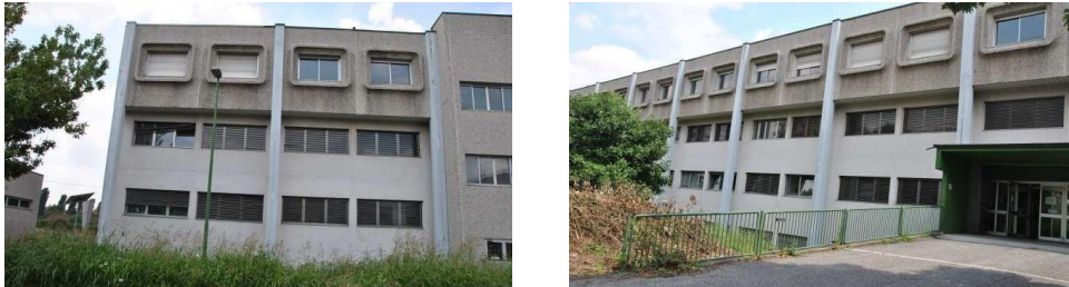
Fig. 1. J.C.Maxwell building: East and West façades

One of the case studies of the Green School project is the J.C. Maxwell School located in Nichelino, a small town belonging to the Turin province, in Italy. The building has a typical imprinting of the time '70 architecture: it's a linear construction with a central hallway and all classrooms are facing East and West. The structure of the building is made of a concrete prefabricated frame of pillars, beams and slabs. An image of the building is shown in Figure 1.