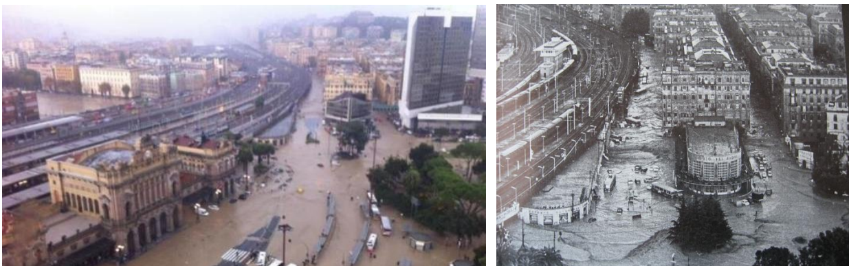
Figure 1. Brignole railway station: flood of 2014 and 1970

After each catastrophe, the Emergency Plan was updated bit by bit with some additional "detailed plans", concerning specific areas or infrastructures, and finally a structural intervention on the creek which caused the flood was programmed.