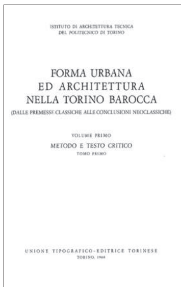
Title page, Istituto di architettura tecnica del Politecnico di Torino, Forma urbana e architettura nella Torino barocca (dalle premesse classiche alle conclusioni neoclassiche) (Torino: Unione Tipografico Editrice Torinese, 1968).