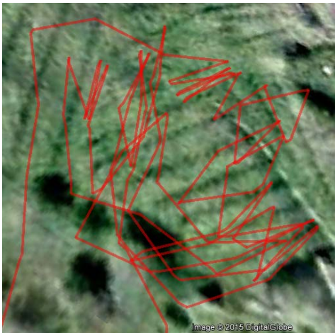
Figure 3. Typical random walk during localization procedure

To run the localization algorithm we measure a RSSI value per second walking around the tag installation area, for less than 9 minutes. More than 500 RSSI values in the space are acquired.