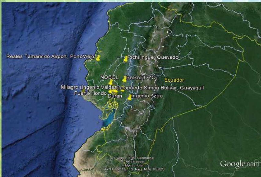
Figure 1. Position of the INAMHI's Automatic Weather Station in South of Ecuador