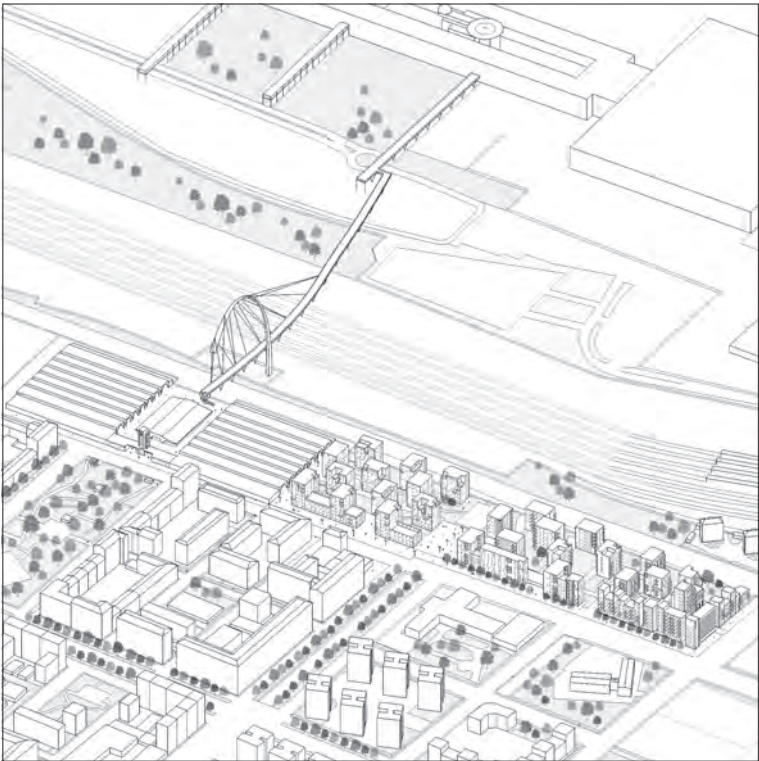
2-5 都灵2006年冬奥会场馆设施轴测图/Axo drawings of Torino 2006 (绘图/Illustrated by Fabrizia Parlani, Sara Ressia)