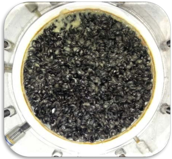
Figure S2: Photographs of both carbon felt (a) and Berl saddles (b) anodes at the end of the experiments.