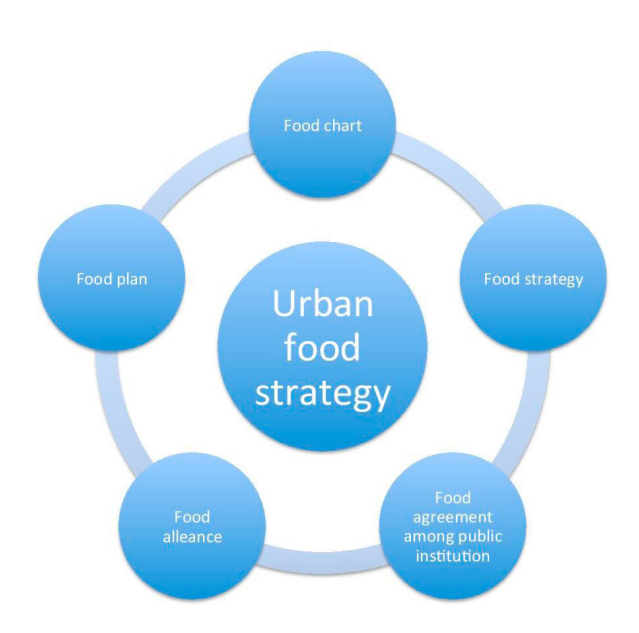
Figure 2: Pisa, Urban food strategy

environment and planning were introduced in the group discussions and ranked according to an open poll. The best ranked strategies and actions were taken into consideration in the "Valdera strategic plan" approved by the Valdera Union.