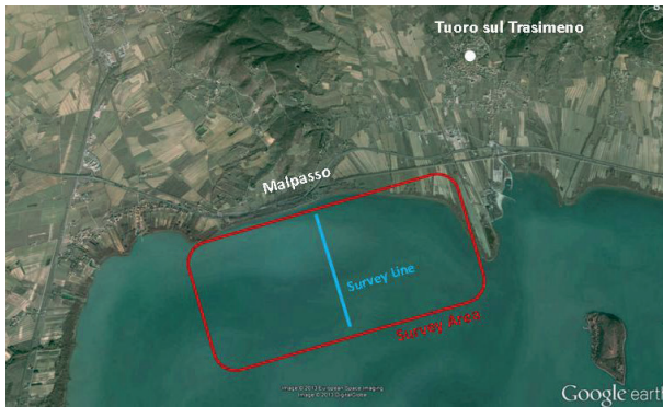
Fig. 1. – Investigated area along the northern shore of the Trasimeno Lake near the Malpasso site. Evidence of the survey line along which the results of geophysical profiles are reported in Fig. 2.

Results and discussions. Both surveys covered the area reported in Fig. 1 in order to obtain a detailed investigation of the surveyed site. We focus here on two almost parallel profiles along a line starting close to the lake northern shore toward the lake center (Fig. 1).