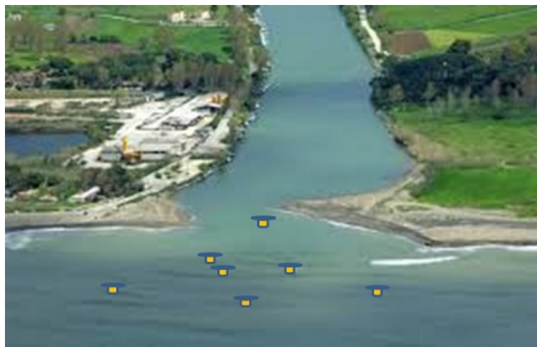
Figure 1. Example of application of the described WSNs of probes. It can be used to monitor the water at the mouth of a river.

Probably, the final shape of the probes will be some sort of a cylinder with a weight distribution such as to have the center of gravity in its lower part. However, for the sake of discussion, let us assume to have a cubic probe, just floating, having a 1 \text{ dm}^3 volume. In order to allow it to sink, we may increase 10% its specific weight by moving one of its surfaces by 1 cm. Of course, there is no problem with this operation when the probe is floating