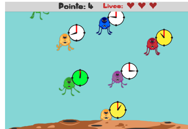
Figure 3: One Switch Invaders screenshot. The figure shows six aliens falling down the screen while the green one (at the left) is being selected.

The game objective is to score points by killing the aliens before three of them touch ground. There are aliens of five colors which constantly fall down the screen at random speed. Each alien is associated to a clock to enable its selection and is generated in a random position at the top of the screen. Figure 3 shows a screenshot of the game.