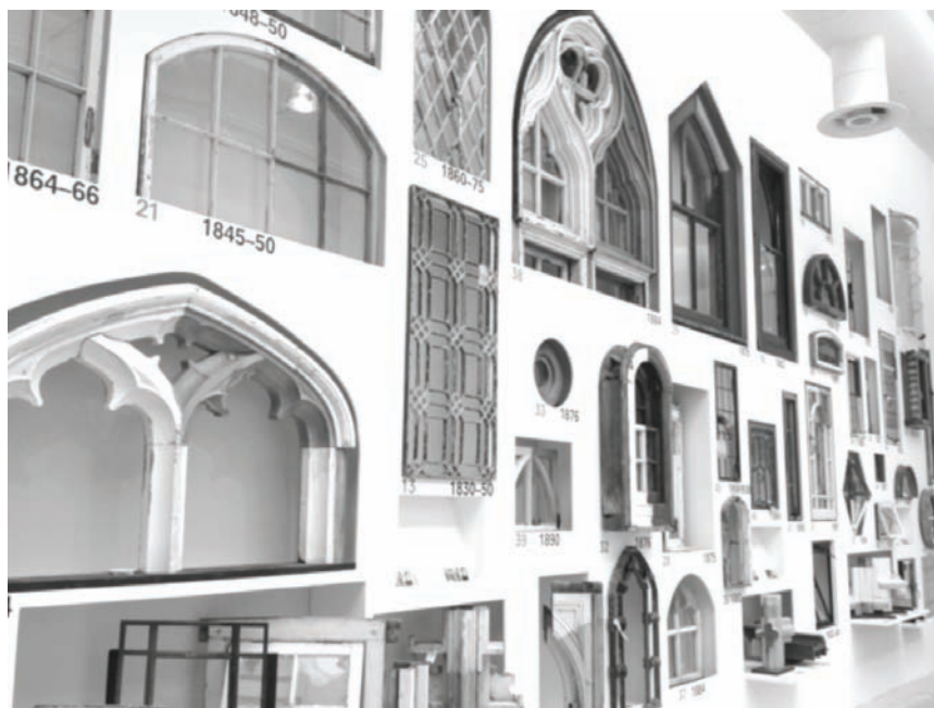
Figure 2. View of the exhibition section 'Window' at the 14th Venice Architecture Biennale. It shows a fragment of the Brooking National Collection containing 'approximately 500,000 pieces, 5000 of which are complete windows, 10,000 windows' sections and 30,000 sash pullings' Source: Fundamentals, catalogue of the 14th International Architecture Exhibition (Venezia: Marsilio, 2014) 211.

and special mentions. 14 If 'architecture not architects', the motto chosen by Rem Koolhaas and his team to accompany the whole event, finds several echoes within this conference, nonetheless the unprecedented profusion of historical evidence on exhibit at Giardini and Arsenale, from architectural elements, details, and drawings to professional journals, illustrated magazines, newspapers, promotional catalogues and advertisements, seem to suggest that the demand for history expressed by the architectural discipline is stronger than ever (Figure 2). And even more striking is the way in which this demand is formulated and fulfilled: through the deployment of large amounts of factual documentation whose main aim would be to bring architects and their public back to the discipline's fundamental concerns, beneficially re-immersing them into the realities (firstly material, but also social, economic, political, ideological, technological, environmental, aesthetic...) of buildings, cities and landscapes, in an attempt to rise above the linguistic barriers that often distance this field of knowledge from its wider audience of users and viewers. By uncovering the plurality of meanings