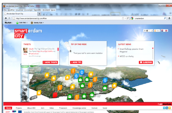
Fig. 2 First page of the Amsterdam Smart City website.

The initiatives inspired by the process of innovation of smart cities are very varied in objectives and strategies (Smart cities. Ranking of European medium-sized cities, 2007); below are cited some examples of European cities (Amsterdam, Malmö, Pisa) that have promoted visions on the model of smart cities with interesting repercussions on the landscape.