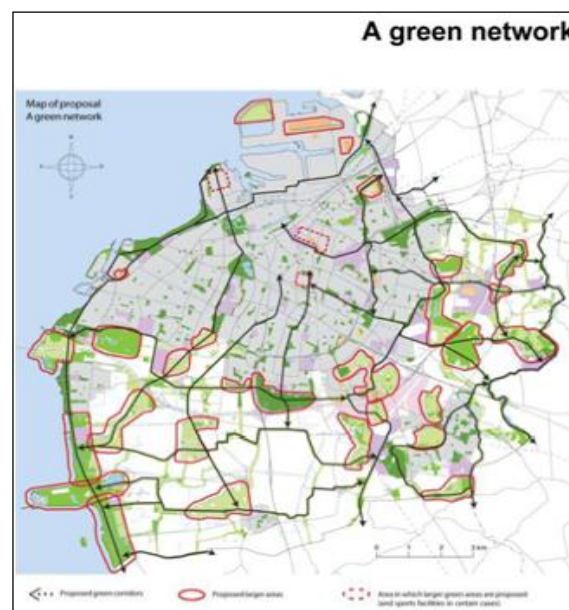
Fig. 3 Malmö smart strategies