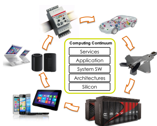
Figure 1: The computing continuum

susceptibility to transient faults (soft errors) and permanent faults (device degradation, wear-out) [2]. One of the biggest challenges for future technologies is the implementation of “dependable” systems on top of significantly unreliable components, which will degrade and even fail during normal lifetime of the chip.