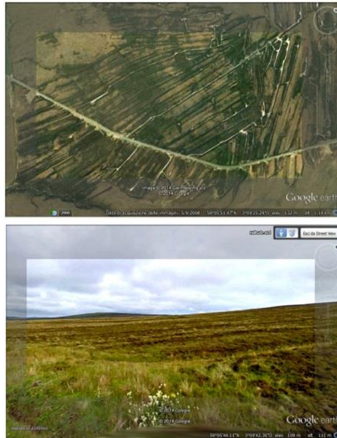
Figure 3: Fields in the central part of Mainland, Orkney Islands, in a satellite image and in Street View.

In Wikipedia [19], the item on lazy beds tells that to them, normally, a desalinated seaweed fertiliser was applied to improve the ground, and that potatoes were often grown in these fields until a potato blight ( Phytophthora infestans ) caused the potato famine in the Highlands. The lazy beds are reported for potato cultivation in several old texts too [20-22]. Therefore, we have that both runrig and waru-waru were used for potatoes; this is not surprising because potatoes grow in well-drained soils, since they dislike soggy soil. “Because they do all their growing underground, they can expand more easily in loose, loamy soil than in heavy, compacted, clay soil that keeps plant roots from getting the air and water they need” [23]. Runrig and waru-waru are answering in the same manner to the same environmental problems connected with potato cultivation.