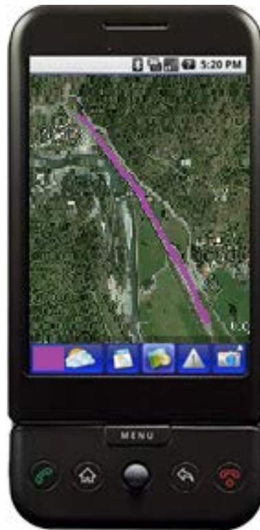
Figure 3. App with real time traffic indication along a user predefined route with data coming from a fleet of cars. Purple color indicates heavy traffic. Icon below refer to other information related to the user defined route (e.g. weather alert, fog alert).

Moreover transfer schemes commonly used in meteorological models, often do not account for small scale variability of the earth surface, because measurements of the atmospheric conditions do not exist in such a high spatial resolution to force the models. A high resolution grid of data coming from the ground improve a lot the performances of the models or validate the models themselves, and ad hoc WSNs can be used for these purposes [17].