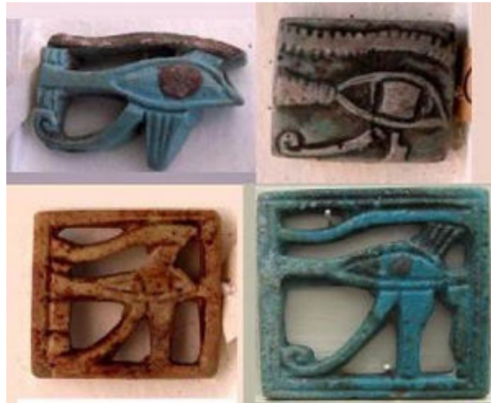
Figure 3: Amulets representing the Eye of Horus, Egyptian Museum of Turin. This Eye is an ancient symbol of protection and good health. It is also known as the Eye of Ra.

Sometimes faience is considered as one of the earliest forms of glass making, and archaeologists suppose that faience, frit and glass were all made in the same workshop complexes. This was deduced from the marked similarity of the composition of faience and contemporary glasses. However, the technology of producing glass and faience is quite different. Let us briefly discuss the working of this ceramic, which is defined as the first human "high-tech" product [14]. Faience is, like our contemporary ceramic materials, an artificial medium; it is a non-clay based mixture, composed of quartz, small amounts of calcite, lime and alkalis. The faience wet mixture is, like the clay, thixotropic, but faience is a difficult material when it has to hold a shape. If pressed too much, it cracks, because of its limited plastic deformation. Therefore, to help its wet working performance, some archaeologists proposed that some binding agents, such as clay, egg white, Arabic gum or resin had been used. However, modern experiments to reproduce the faience suggest just the use of alkalis as binders, such as natron or plant ashes [11].