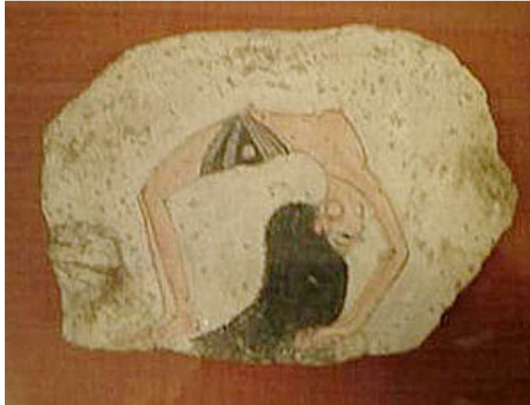
Figure 1: A shred can be a small piece of art, as we can see in this ostracon of the Egyptian Museum of Turin.

The earliest ceramics made by humans were pottery objects, which were made from clay and hardened in fire. After, ceramics evolved in their composition and became glazed to have a coloured, brilliant and smooth surface. The Egyptian faience is one of these ceramics, based on sintered-quartz materials, which has a glossy surface with lustre of various blue-green colours.