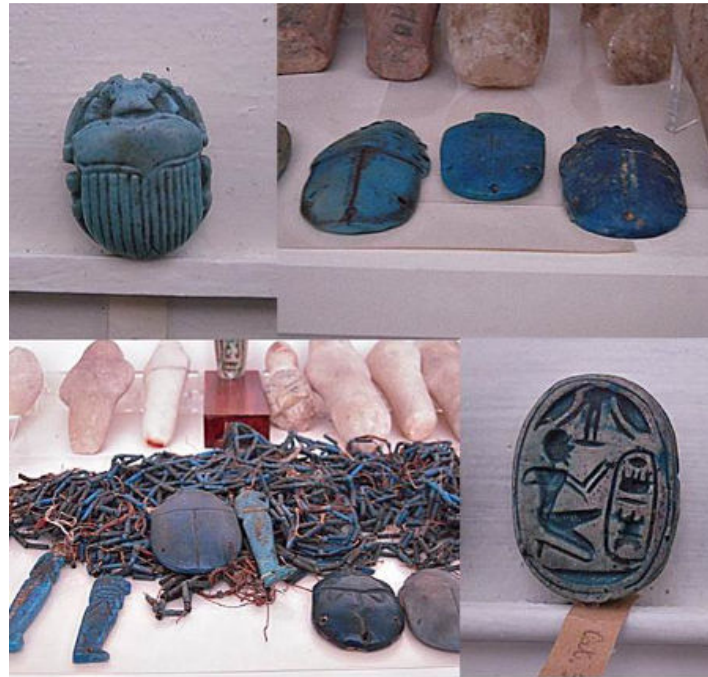
Figure 5: Egyptian scarabs were amulets, often made of faience, having the shape of a scarab. They were also used as seals. Scarab amulets, which represent the sun god, are the symbol of the renewal of the day and of rebirth. And therefore they were included among the grave goods. Here we see scarabs, some funerary figurines and a beaded net of a mummy from the tomb of Khaemuaset and Setherkhepshef, New Kingdom, Dynasty XVIII-XX, Egyptian Museum of Turin. Attached to the net we have a winged scarab and figures of the Sons of Horus.