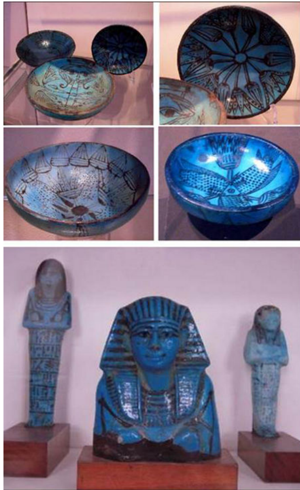
Figure 4: Upper images show faience bowls blue-glazed and decorated. One of the bowl, besides the decoration with lotus flowers and blossoms has two symmetric faces of the goddess Hathor. This decoration is therefore a symbol of rebirth. Unknown origin. New Kingdom, Dynasty XVIII-XX (1350-1070 B.C.), Egyptian Museum of Turin. Middle left: faience bowl decorated with lotus flowers and blossoms from the Kha's Tomb, Egyptian Museum of Turin. Middle right: wonderful bowl of blue faience, unknown origin, decorated with lotus flowers and fishes. First period of XVIII, Dynasty (XV century BC), Aegyptisches Museum und Papyrussammlung of Berlin. The decoration seems a work by Maurits Cornelis Escher. In the lower panel, we can see some funerary figurines known as shabtis of Sety I, from the Valley of the Kings, XIX Dynasty, Egyptian Museum of Turin.