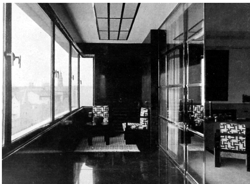
Fig. 8. Veranda of the president's office. La Casa bella , n.32 (1930), p. 21.