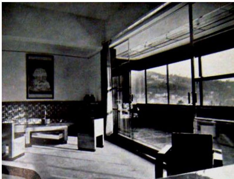
Fig. 7. The president's office. La Casa bella , n.32 (1930), p. 16.

Gualino's office was at the top of the building (Fig. 7). In Domus the painter Gigi Chessa published an enthusiastic comment on this interior design: «Isolated on the top floor, away from street noise, is the most refined and comfortable work environment [...]. But who can describe the beauty of the large window made of glass and chromed steel, and the veranda covered with shiny black?» 17 . In this space, the use of glass is symbolic: glass was the metaphor of moral transparency of the director and used as a medium of the corporate image (Fig. 8).