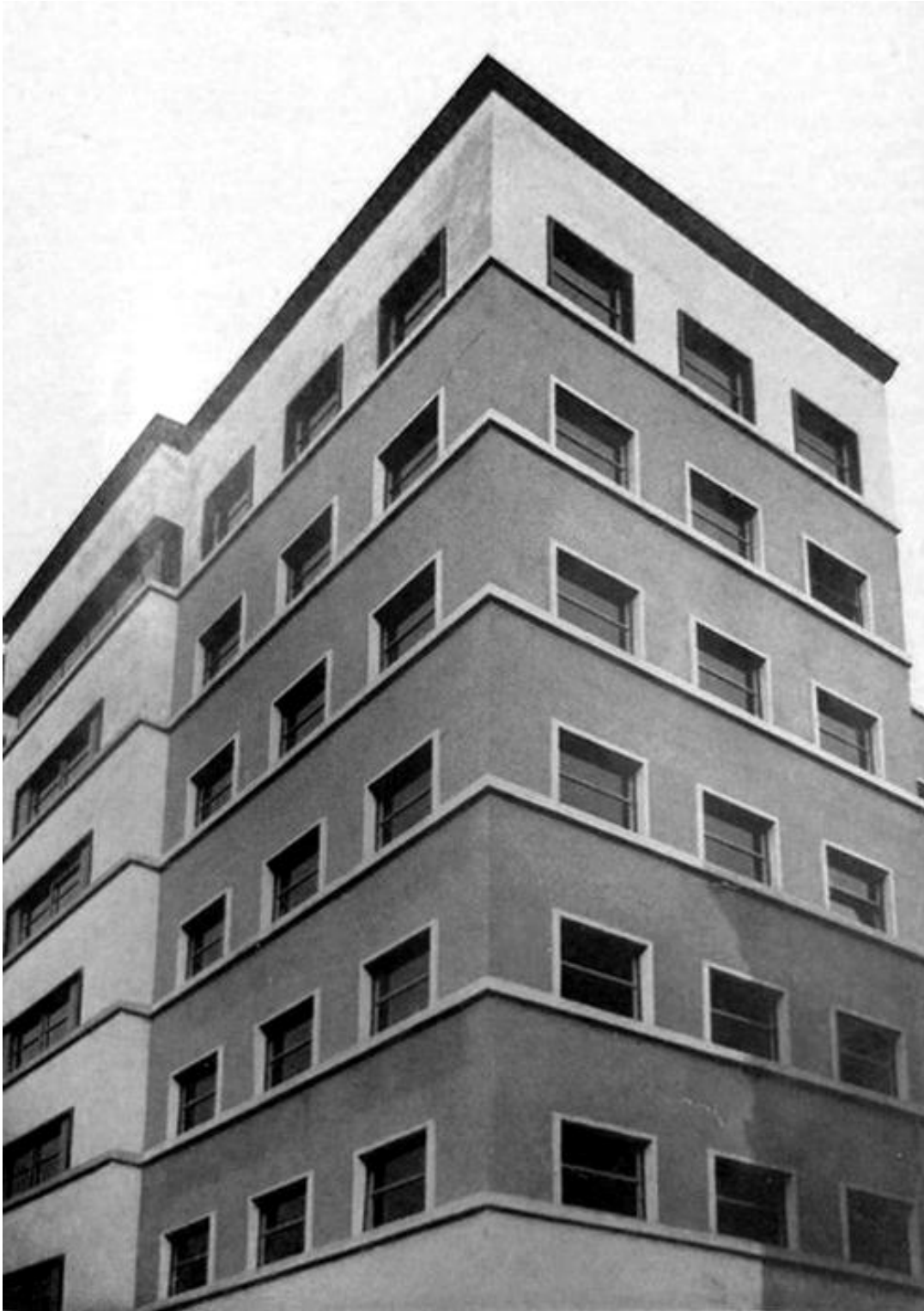
Fig. 1. Palazzo Salpa called Palazzo Gualino (Turin, 1928-1930). La Casa bella , n.32 (1930), p. 11.

Lamps were positioned around the openings to signal the entrance and, in the evening, the whole building became a dark background with no volume where the windows changed into large lamps. Furthermore, it was the result of a total work of art where every detail was conceived to be a part of a whole.