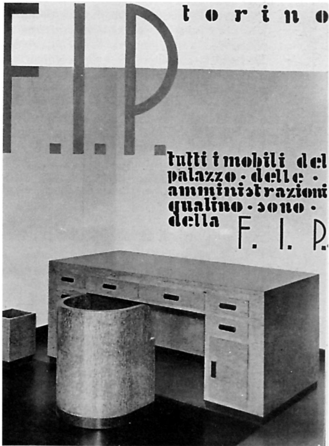
Fig. 5. F.I.P. advertisement. Domus , n. 30 (1930), sp.

Furniture was composed of pure volumes made shiny by the combination of different buxus veneers (Fig. 6). The new material was produced by the Cartiere Giacomo Bosso and worked by F.I.P. in Turin 16 .