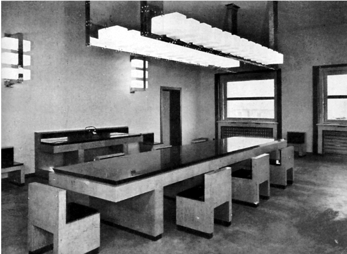
Fig. 4. Boardroom with Salpa leather floor, lamps using Artax cubes and F.I.P.'s furniture in grey and black buxus. Domus , n. 30 (1930), p. 66.

The building looked like a great “body” in the service of a great industry. «Light signals, ringtones, phones accelerate the work, organizing activities, the possibilities multiply in perfect step with the fastest machines of the big industry that feeds these offices» 15 .