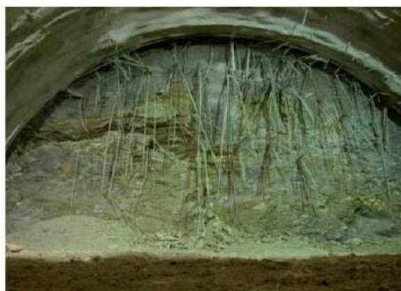
Fig. 2. Tunnel face (intensely weathered mica schists)