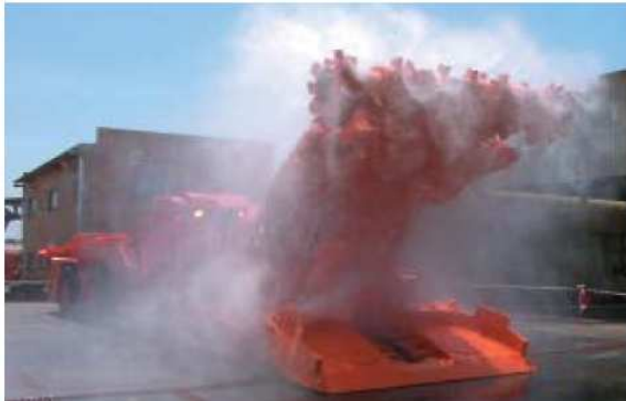
Fig. 6. Roadheader fitted with a de-dusting system used as a possible winning means in critical formations

When a full-face technique is used in the tunneling excavation, it is important to note that some types of machine, such as the hydrosshield and slurryshield, intrinsically remove the excavated materials, with a hydraulic close circuit, from the excavation chamber.