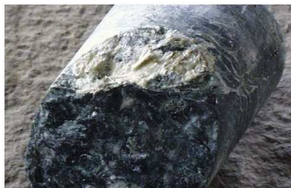
Fig. 5. Drill cores from serpentine bodies from the Western Alps

According the Authors' experience in the Italian Western Alps (Fig. 5 shows an example of a drill cores from the Western Alps) it can be stated that surface core drills, even though essential for the characterization of large scale rock formations in terms of geological and geo-mechanic aspects, cannot be considered exhaustive for an evaluation of the asbestos content. For these reasons, progressive core drillings from the tunnel face are always necessary, regardless of the surface drilling results, to obtain information at a local scale on the expected presence of asbestos along the tunnel route.