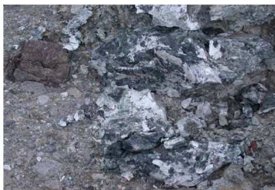
Fig. 3. Asbestos elements in the fractures of heaped muck intended for reuse