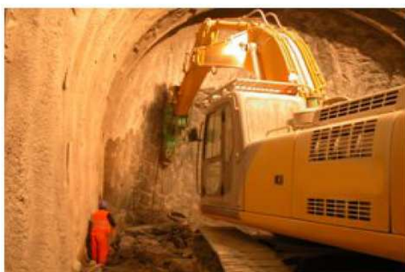
Fig. 4. High Hydraulic Energy Hammer at work while a second worker provides the machine operator with visual help and “tries” to reduce the airborne dust pollution by spraying water onto the face

This can be considered a particularly serious and double problem, since the tunneling operations obviously