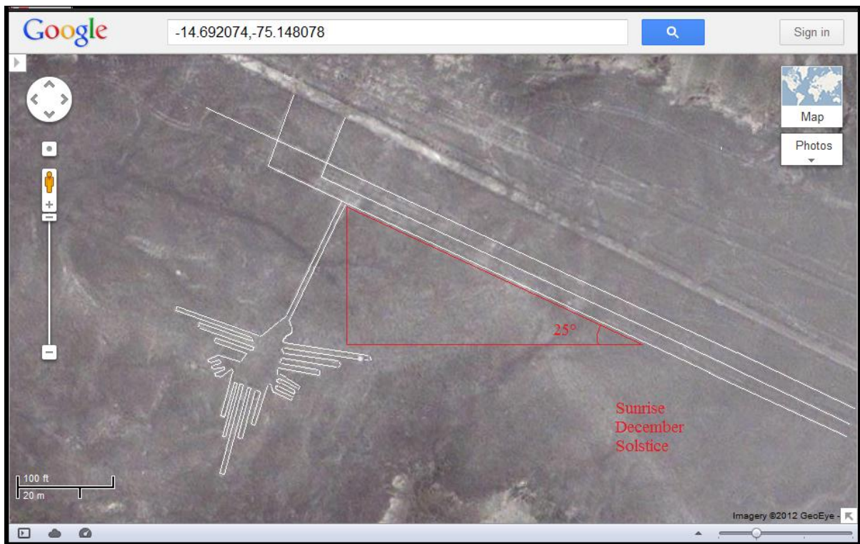
Figure 4. The geoglyph of the Hummingbird has the bill touching a line having the direction of the sunrise on the December solstice. The Peruvian writer and poet José María Arguedas imagined “picaflores que llegan hasta el sol para beberle su fuego”, that is, hummingbirds flying toward the sun to drink his fire.

compare this image with the words that the Peruvian writer and poet José María Arguedas wrote. He imagined “picaflores que llegan hasta el sol para beberle su fuego”, that is hummingbirds flying toward the sun to drink his fire.