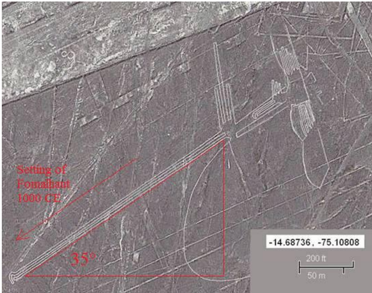
Figure 3. The Nazca Frigatebird. His bill was pointed towards the setting of Fomalhaut in the Piscis Austrinus.

My proposal [7] was that the Frigatebird had represented a bird snatching his food from the ocean surface, in the same manner as the geoglyph is snatching the star from the horizon. Note that Fomalhaut is the alpha star of the Piscis Austrinus. Then, some of the Nazca geoglyphs can be viewed as linked to constellations, as Maria Reiche suggested. However, these geoglyphs are not depicting the constellations in a strict sense, that is, they are not drawings that show the apparent relative positions of the stars. I prefer telling that the geoglyphs of animals can be some representations of the life on Earth projected in the sky. Therefore, the frigatebirds feeding themselves on the ocean are represented by the Frigatebird geoglyph that catches Fomalhaut at its setting after the run in the night sky, as if it were a fish in the ocean.