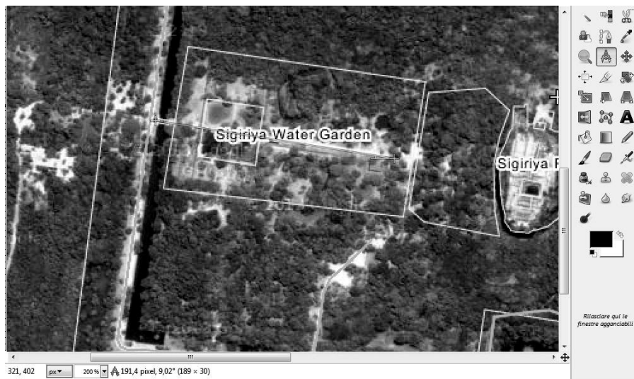
Figure 2 – Measurement of the angle using the GIMP compass.

In the Ref.4 it is told that the water gardens are built symmetrically on an east-west axis. In fact, the design of the gardens is symmetrical, however the axis is not oriented on the cardinal east- west line: the site is inclined of 9 degrees, as we can measure from satellite maps (Figure 2).