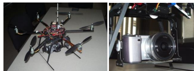
Figure 1 First version of Mikrokopter hexacopter (left); on board camera (right).

This system is a commercial solution available off the shelf and is a cheaper tool than the traditional UAV (Figure 1, left). Its cost is less than 5000€, considering the commercial kit and assembly step.