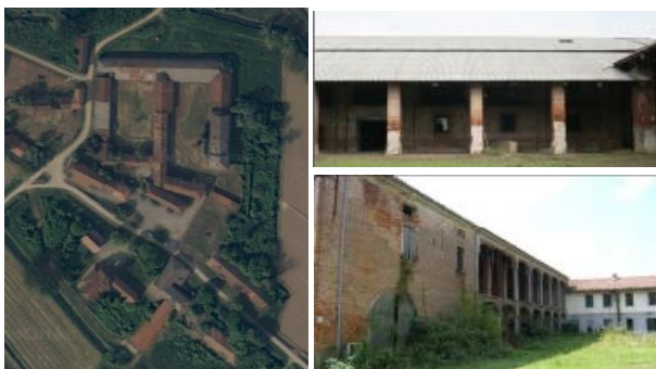
Figure 10 Aerial view of Leri Cavour (left) and two images of the actual state of the main buildings (right).

Leri Cavour (Figure 10) is an abandoned farmstead complex that is under a regional requalification project.