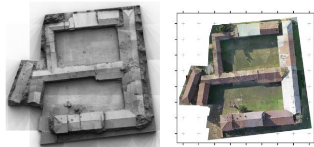
Figure 11 Depth maps obtained with MicMac (shaded mode) (left) and achieved orthophoto (right)

In order to evaluate the accuracy of the obtained orthophoto, several CPs were compared with the coordinates obtained from the traditional topographic survey. The discrepancy between the two coordinate set for all of the CPs was close to 60 cm, with some “outliers” close to 2 m along the borders of the orthophoto.