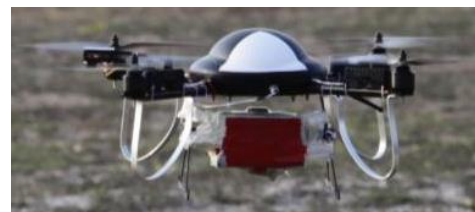
Figure 4 DRACO system

The DRACO is piloted with a special controller, which is directly connected with the ground control station. This controller has a small LCD where it is possible to see the map in real time or the video which is streamed by the UAV. Using the controller, the pilot can also create a mission, set the flight plan, set the shooting time, and so on. The duration of the flight is better: 16–18 minutes.