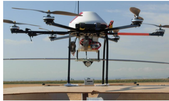
Figure 3 The Microkopter hexicopter modified by RESTART

Like the previous hexicopter, it is possible to have an autonomous flight, and a flight plan can be realized.