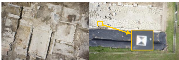
Figure 8 Two acquired images in the area of Via Gemina: high flight (left) and low flight with a zoom on a target (right).

The results of the photogrammetric process are shown in Table 1, where the standard deviations on the GCPs and the CPs are reported ( \sigma_0 = 10 ).