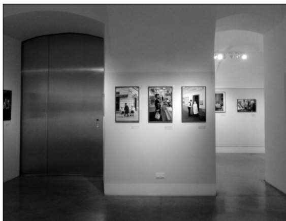
Fig. 1. Museum Judenplatz, view of the exhibition rooms.

I do not mean this in the sense of non-place defined by Augé, but spaces without an actual geographical and temporal connotation, aseptic, where is the memory to speak. A sort of mortuary of the past. The museum, in fact, opts for a very minimalist style, but also very refined in its details enhanced by a choice of cold materials: concrete and steel (fig. 1).