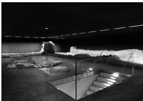
Fig. 2. Museum Judenplatz, excavation room.

The walls of the excavation room are covered with galvanized brass, the floor is formed by a metal grid in which are inserted 60,000 blocks of clay, which absorb the light and attenuate it. In the room there are no “multimedia-games” or details, ex-