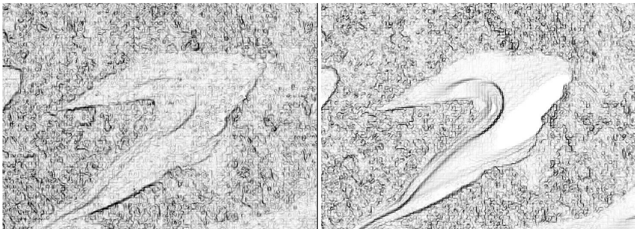
Fig.2 – The images in the Figure 1 have been processed with the Sobel filter of GIMP, adjusting the threshold. Here the filtered images are shown in inverted colors. These two images can be used as layers and added to the original images of Figure 1. The result is proposed in the Figure 3.