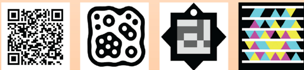
Figure 1. Different types of visual markers

Vision-based localization systems rely either on natural image features ([3]) or on visual markers, also called fiducials. Natural image features are edges, colour regions or local image descriptors, mathematical entities providing a characterization of the image region surrounding a point of interest that is invariant to image transformations such as rotation, scaling and illumination changes. The use of natural features requires solving various problems. First, as a pre-processing stage, it entails building a visual map of the environment, which relates features extracted from images to their exact spatial location. This step is complex and time-consuming, and requires updating the visual map at every change in appearance of the environment. Second, natural feature matching requires a huge computational power and it is, therefore, unfeasible on most off-the-shelf devices. To soften the problem, the feature extraction and matching process can be simplified, with a consequent precision loss. Another possible solution is the processing of the images through a remote server, increasing the time required to obtain the positional data and involving privacy issues related to transmitting and storing images potentially portraying individuals inside the environments.