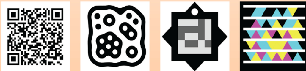
Figure 1. Different types of visual markers

Vision-based localization systems rely either on natural image features ([3]) or on visual markers, also called fiducials. Natural image features are edges, colour regions or local image descriptors, mathematical entities providing a characterization of the image region surrounding a point of interest that is invariant to image transformations such as rotation, scaling and illumination changes. The use of natural features requires solving various problems. First, as a pre-processing stage, it entails building a visual map of the environment, which relates features extracted from images to their exact spatial location. This step is complex and time-consuming, and requires updating the visual map at every change in appearance of the environment. Second, natural feature matching requires a huge computational power and it is, therefore, unfeasible on most off-the-shelf devices. To soften the problem, the feature extraction and matching process can be simplified, with a consequent precision loss. Another possible solution is the processing of the images through a remote server, increasing the time required to obtain the positional data and involving privacy issues related to transmitting and storing images potentially portraying individuals inside the environments.