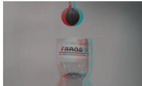
Fig. 1. Sample video scene captured by the stereoscopic video system. Rendered as a red-cyan anaglyph for printing only.

The software has been developed ad hoc for this particular setup with the primary aim to minimize latency. Although the hardware capabilities allowed to capture images with 1280 \times 720 resolution in stereoscopic mode, an acceptable latency could be achieved with our setup only when the resolution was equal or lower than 640 \times 360 . More technically, the transmitter part relies on the primitives provided by the Android OS, and video compression routines have been written in native code to improve performance. The receiver software runs on a desktop PC with Linux OS, equipped with the Nvidia 3D vision kit and a graphics hardware supporting OpenGL with the stereoscopic capability.