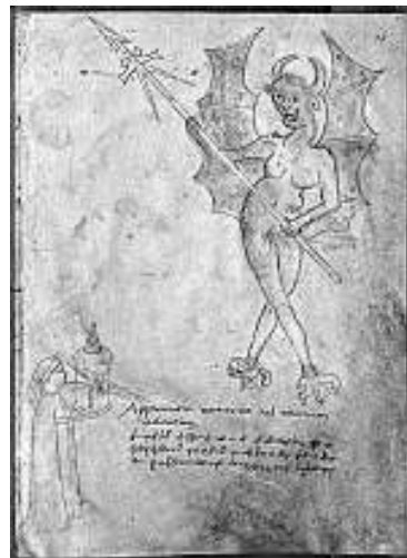
Fig.1. The magic lantern