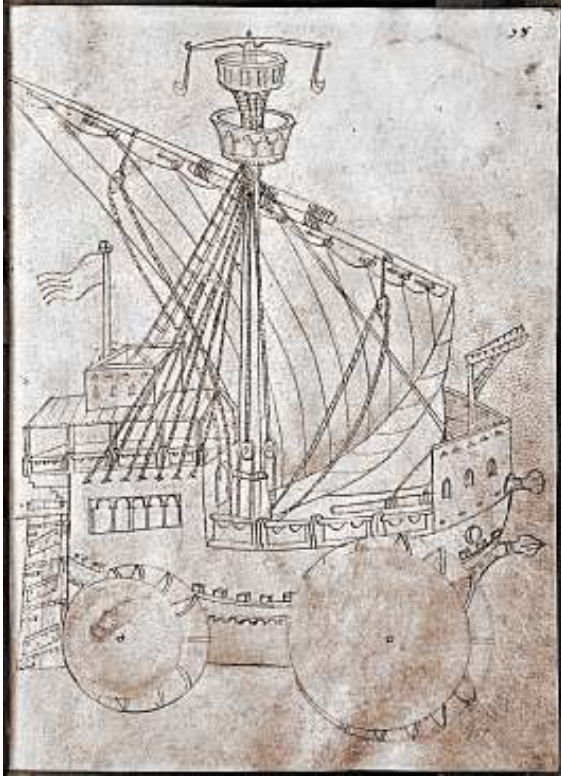
Fig.3 The sailing castle.