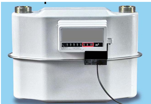
Figure 2. Example of common gas metering system. The black box is the commercial pulse transmitter which is connected to the sensor board of the smart grid shown in Figure 1.

The electronic board of each sensor node is able to handle any failure such as low battery, possible short-circuits on reading pin, quartz and clock problems. Its firmware is realized to switch on a specific led for different error or malfunctioning, and to stop sending data to the AP in case of failure. An authorized user connected to the smart grid web interface, or whose e-mail address or phone number is part of the list at which the AP sends e-mails and SMS, can thus note that a specific node is no longer active, and can program a maintenance field intervention in order to repair or substitute the damaged node. The specific failure is identified by the corresponding led turned on without performing difficult tests.