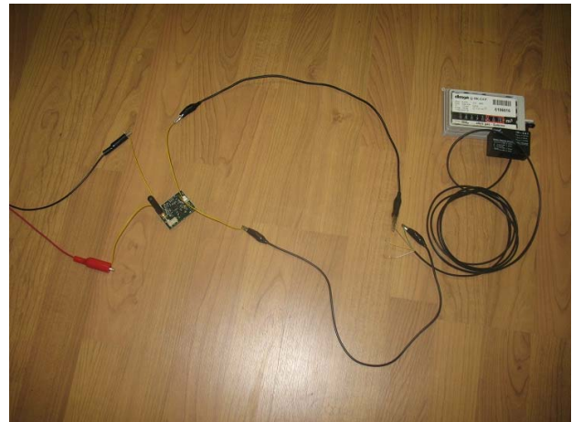
Figure 6. Smart grid node during the massive stress test connected to commercial pulse generator which will be connected to the gas meter in a real application.

Experimental current consumption was very low in 4 out of 5 test nodes, in accordance to datasheet information, allowing a life period of each node of almost 10 years, as decided in designing stage. The higher current absorption of the fifth node is due to imperfections in the realization of electronic boards (e.g. not perfect components welding).