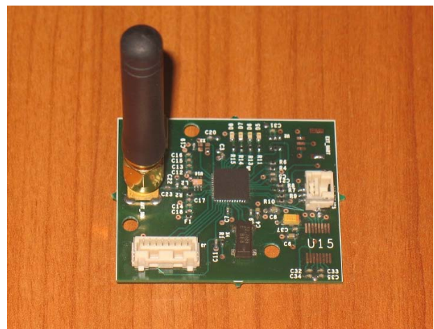
Figure 1. Realized electronic board for smart grid nodes.

The board power consumption depends on the chosen operating modes. In particular it is very sensitive to the selected output power (up to a maximum of 10 dBm) which cause a consumption to a few tens of milli-Amperes [10]. In the described prototype, low power firm ware techniques have been adopted in order to properly managed the board, reducing the power consumption, keeping the microcontroller in the so called “Low Power Mode” as long as possible, since in that condition the amount of absorbed current is equal to a few micro-Amperes. It is possible to achieve a theoretical durations of 10 years using commercial standard lithium batteries of 3.6 V.