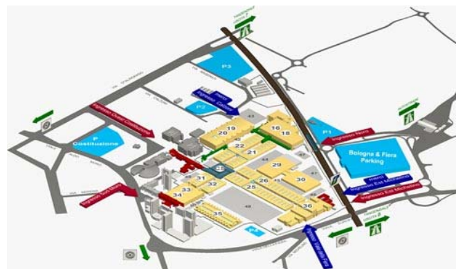
2 nd and 3 rd Images: some BolognaFiere external and internal views and the actual plan

Bologna Expo District, is a major expo pole with a Head Office and many other service units. The complex has been developed since 1965 and cover more than 180.000 mq on area of nearly 350.000 mq. 27