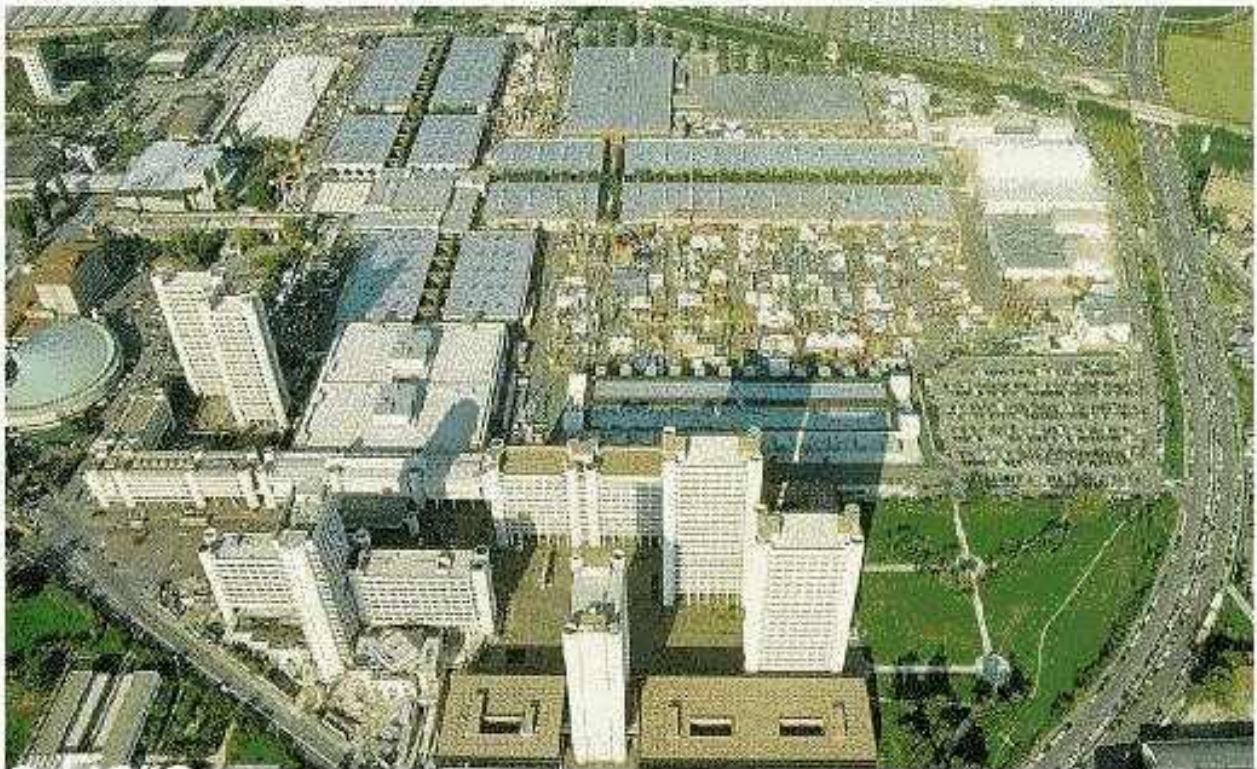
The Italian "BolognaFiere" Expo District panorama

How the instrumental tangible assets can be estimated in the Italian context according to the International Accounting Standard n. 16