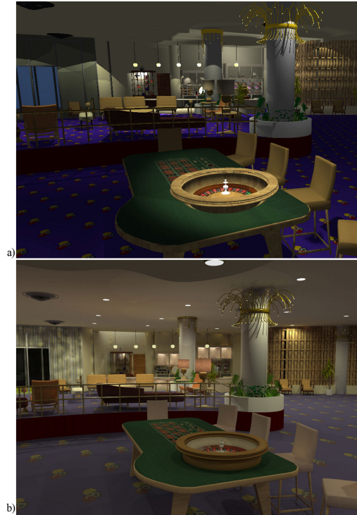
Figure 4. Images of the rendered VEs: (a) RTVE, (b) IBVE

Traditional techniques for visualizing VR environments are based on real-time rendering of 3D models, which are described geometrically in terms of polygonal meshes, with associated surface properties and textures. The view on the virtual world is changed interactively by the user, which is free to move at his/her own will into the VE. Database elements have been inserted into the environment as hotspots, and their presence highlighted with a recognizable graphic element (Figure 3, left).