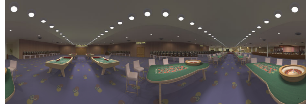
Figure 5. 360° panorama of the Riviera Gaming Room

together. The resulting panoramas have a resolution of 7.000x2.450 pixels (see Figure 5). An example of the view on the VE can be seen in Figure 4(b). Again, the items in the database were modeled and added to the reconstructed environments, and their projection on the panoramic images has been used as hotspots (Figure 3, right). The viewer for panoramic images is based on Flash technology, allowing it to be executed on different platforms and embedded into HTML pages.