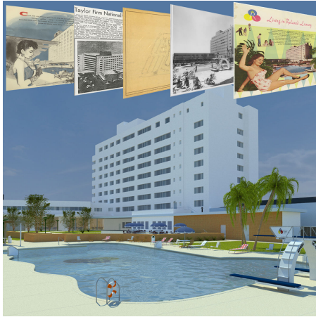
Figure 2. Some digitized historical sources - photos, videos, postcards – and a view of the virtual reconstruction of the Riviera casino

In order to test our interfaces, we built, as case study, a prototypal application aimed at presenting the collection of historical documents related to the Riviera casino-resort, in Las Vegas. The Riviera, opened in 1955 on the Las Vegas Boulevard (“the Strip”), was the first skyscraper in Las Vegas and became one of the most important and luxurious resort in the city. Several famous singers and artists of the period, including the showman Liberace, the highest paid artist in the world in the '50s, performed in its theater. The primary source of documentation was UNLV’s Special Collections archive, established at the end of the 1960s with the purpose of documenting the history, culture, and events that contributed to the development of the city of Las Vegas. The section dedicated to the Riviera includes project documents, images of the resort, photographs and documents of the leading characters and of the most important events related to the resort. Other information was found in books, newspapers and magazines of the period. The research data were digitized and stored in a database, with accompanying metadata concerning the collection and management thereof. This information was also used to create the 3D models of the original premises for the Riviera virtual reconstruction and of all the objects, furniture, and elements included therein (Figure 2).