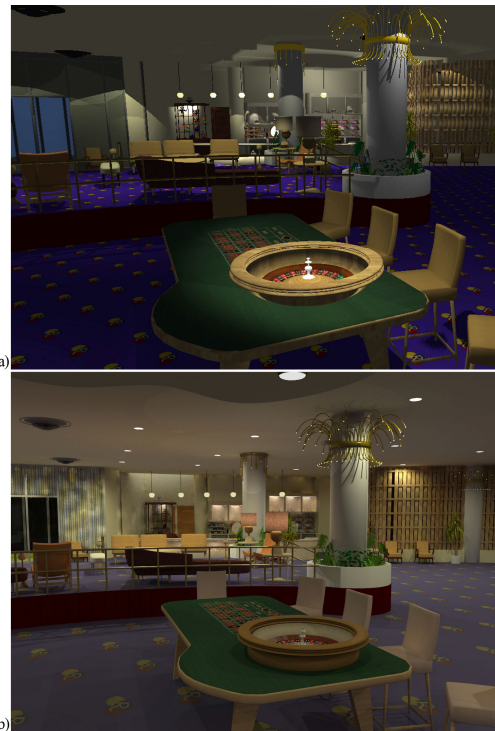
Figure 4. Images of the rendered VEs: (a) RTVE, (b) IBVE

Traditional techniques for visualizing VR environments are based on real-time rendering of 3D models, which are described geometrically in terms of polygonal meshes, with associated surface properties and textures. The view on the virtual world is changed interactively by the user, which is free to move at his/her own will into the VE. Database elements have been inserted into the environment as hotspots, and their presence highlighted with a recognizable graphic element (Figure 3, left).