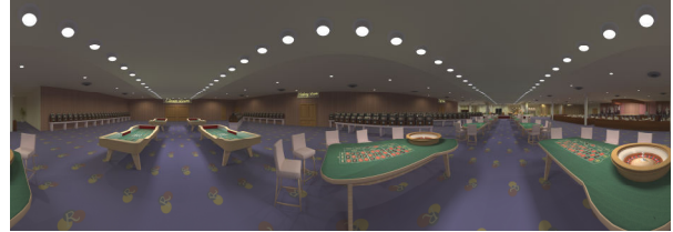
Figure 5. 360° panorama of the Riviera Gaming Room

together. The resulting panoramas have a resolution of 7.000x2.450 pixels (see Figure 5). An example of the view on the VE can be seen in Figure 4(b). Again, the items in the database were modeled and added to the reconstructed environments, and their projection on the panoramic images has been used as hotspots (Figure 3, right). The viewer for panoramic images is based on Flash technology, allowing it to be executed on different platforms and embedded into HTML pages.